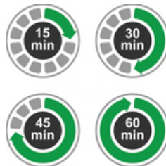
Establish a schedule for regular check-ins with your buddy