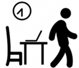
Tell your buddy when you are leaving