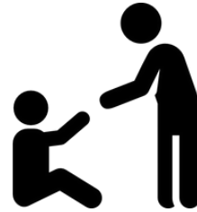
Willing to help