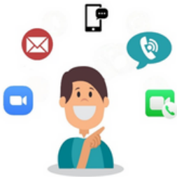
Tell your buddy when you are on campus

If working alone is unavoidable, a risk assessment should be completed to determine what work is safe to do with a remote lab buddy and what type of work is off limits. Ensure that your PI authorizes work done alone , create an emergency plan , and use the remote buddy system . Remote buddies should know how to activate your emergency plan .